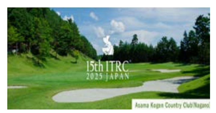
Asama Kogen County Club.

Members-only golf course opened in 1990. All 18 holes, PAR72. The fairway, rough and teeing areas use Japanese Zoysia grass ( Zoysia japonica ), while the putting green uses Penncross creeping bentgrass. The altitude is 700 m at the clubhouse, 500 m at the lowest point, and 1,000 m at the highest point.