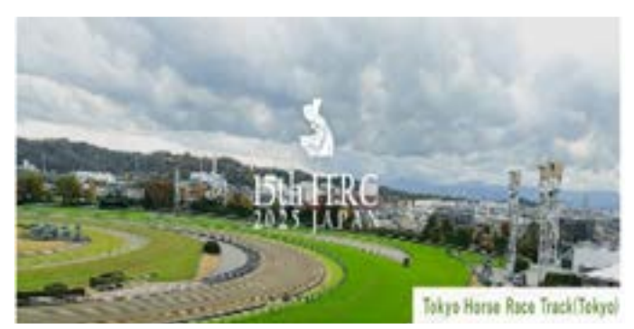
JRA Tokyo Racecourse.

Members-only golf course. Total of 27 holes in flat forest area. Opened in 1961. The fairway and teeing ground use Manila grass ( Zoysia matrella ), the rough uses Zoysia grass ( Z. japonica ), and the putting greens are established with bentgrass.