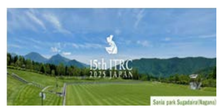
Sania Park Sugadaira.

Members-only golf course opened in 1990. All 18 holes, PAR72. The fairway, rough and teeing areas use Japanese Zoysia grass ( Zoysia japonica ), while the putting green uses Penncross creeping bentgrass. The altitude is 700 m at the clubhouse, 500 m at the lowest point, and 1,000 m at the highest point.