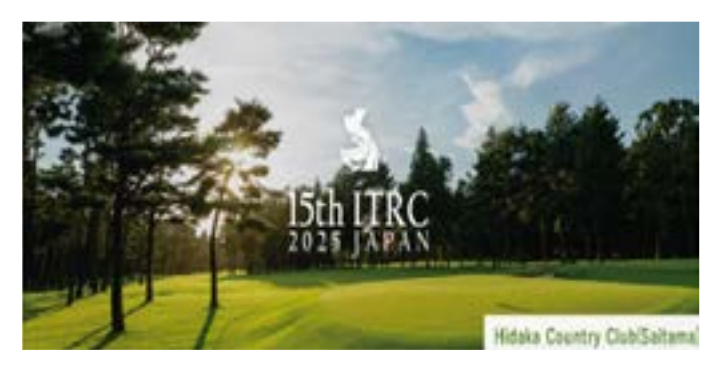
Hidaka Country Club

Members-only golf course. Total of 27 holes in flat forest area. Opened in 1961. The fairway and teeing ground use Manila grass ( Zoysia matrella ), the rough uses Zoysia grass ( Z. japonica ), and the putting greens are established with bentgrass.