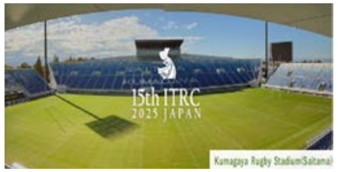
Kumagaya Sports Culture Park, Rugby Stadium. Display of masterpieces and outstanding bonsai works. Presentation of the history of bonsai arts.