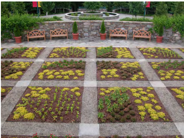
The Gardens at Biltmore Estate