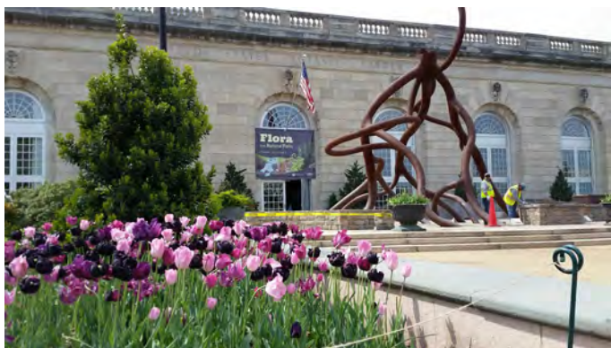
The United States Botanic Garden