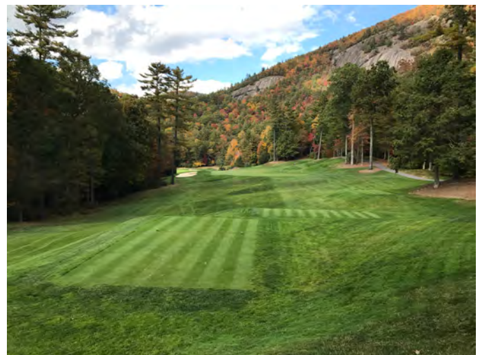
Wade Hampton Golf Club