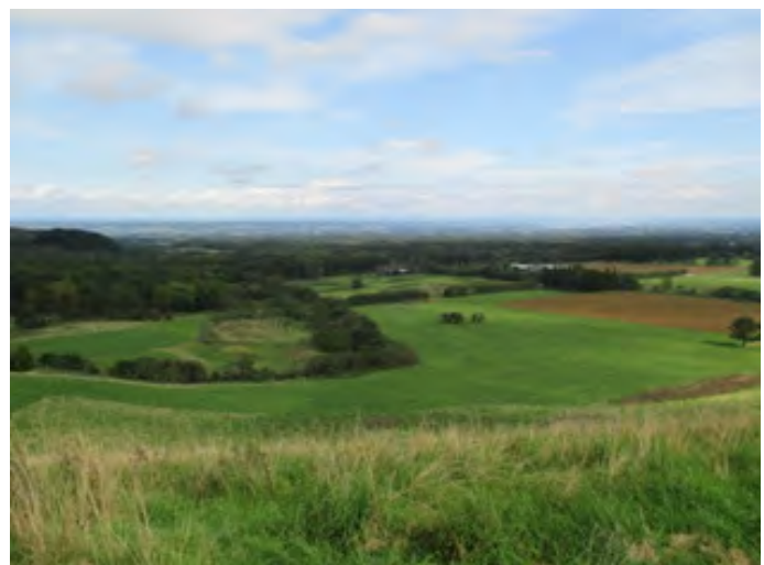
Earth Garden at Tokachi Millennium Forest

On the second day of the meeting, we visited turfgrass sites around the Obihiro area and these were as follows: 1) Obihiro Forest Park, 2) Memuro Park, 3) Tokachi Millennium Forest, 4) Park Golf site at Makubetsu-cho, and 5) Tokachi Ecology Park.