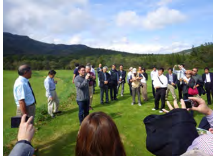
Welcome message by the president of Tokachi-Mainichi Press at Tokachi Millennium Forest

The morning session on the first day at the fall annual meeting had four separate meeting groups. These groups included golf courses, ground cover plants, school turf, and parks. For the afternoon session, the general meeting and keynote lectures were held. The keynote lecture speakers and their titles were as follows: