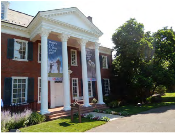
The USGA Museum / Testing Facility

3) The Met Life Stadium Practice Facility (Home to the New York Giants and Jets American Football Teams) and Yankee Stadium (home of the world famous New York Yankees and the New York City Football Club of Major League Soccer).