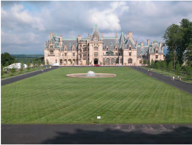
The Biltmore House