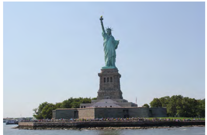
The views from the cruise

Immediately following the ITS Quadrennial Business Meeting and the Graduate Student Awards Presentations on Thursday, 20 July, attendees will board buses for a night on the town featuring a Twilight Dinner Cruise of the NY/NJ Harbor and Statue of Liberty, with awesome views of the New York City Skyline, great food and dancing. This is a once in a life-time event that your entire family will want to see.