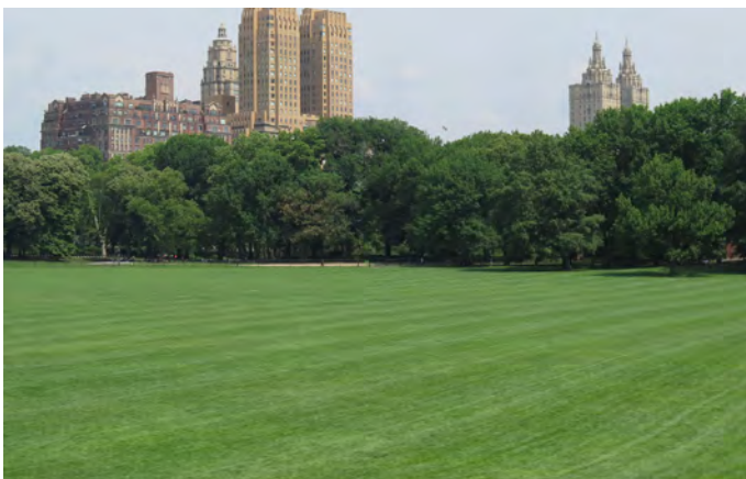
The Great Lawn at Central Park

5) Central Park (the iconic green space on Manhattan Island) and the American Museum of Natural History /Hayden Planetarium (one of the world's pre-eminent scientific and cultural institutions renowned for its exhibitions and scientific collections).