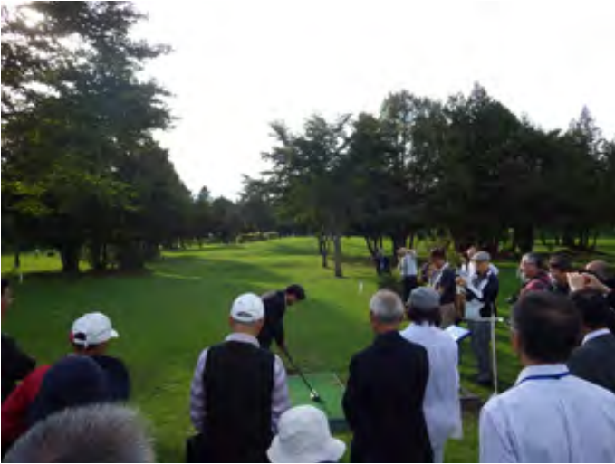
Park golf which was invented in Makubetsu-cho, Hokkaido.

Tokachi Millennium Forest has beautiful award-winning gardens. The Forest was established on the idea of “carbon offset,” an environmental conservation activity to reduce greenhouse gas emissions. The Park golf site was invented in Makubetsu-cho, Hokkaido. All you need to play park golf is one club, a ball and a tee. Everyone from children to elderly people can enjoy this community sport. It is becoming very popular in the Hokkaido area specially, so now it has spread to of all Japan including Okinawa, the southern part of Japan.