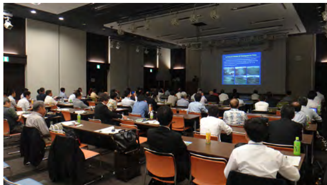
Attendees at the IZS in Naha City.

The Japanese Society of Turfgrass Science (JSTS) held their 2015 fall annual meeting and International Zoysiagrass Symposium (IZS) in Naha City, Okinawa, Japan on November 20-23 at the Okinawa Jichi Kaikan. Okinawa is the southernmost prefecture and is a humid subtropical island with a yearly average temperature of above 20 C (68 F). Most of us enjoyed the warm, welcoming weather during the visit.