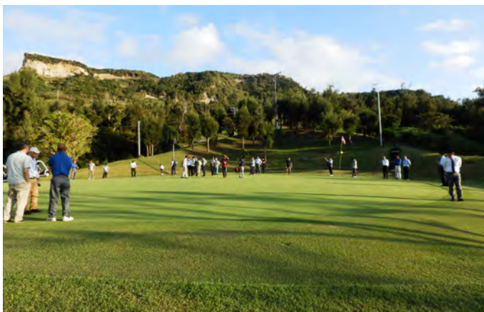
Attendees at Shurei Country Club observe a bentgrass green.