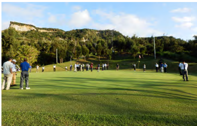
Attendees at Shurei Country Club observe a bentgrass green.