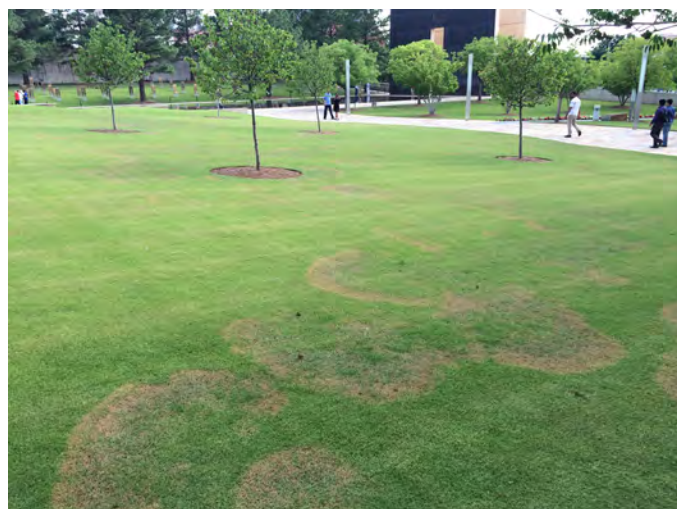
Large patch at the Oklahoma City National Memorial.

On the second day of the meeting, remaining state reports were presented and turfgrass weed control, distance education, innovative instruction techniques, light requirements, and water use research were discussed. Following the business meeting, a smaller group of individuals traveled to Stillwater