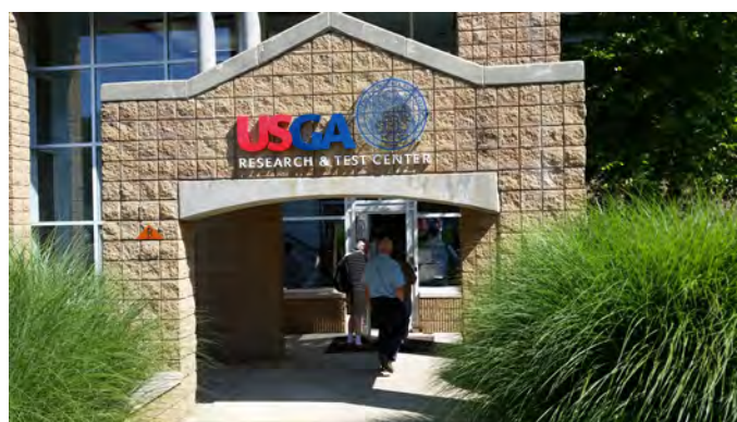
Visit to the USGA Museum and Testing Facility.

the 13 th ITRC in 2017. These included a visit to Yankee Stadium, home to the world famous New York Yankees professional baseball team; the United States Golf Association museum and testing facility; Bayonne Golf Club, called “the most audacious golf course in the world” by a writer for Sports Illustrated magazine; a cruise around the Statue of Liberty on the Bayonne Golf Club’s private boat; and the Red Bull Arena, home to the New York Red Bulls of Major League Soccer. These are but a few of the tour stops planned for 2017. The final stops were to the Rutgers research farms in North Brunswick for a brief visit and then to Adelphia for a BBQ dinner.