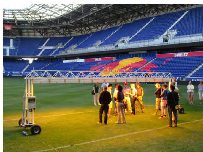
Visit to Red Bull Stadium.