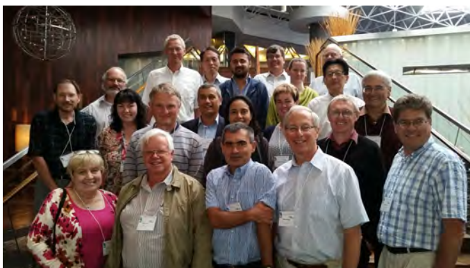
ITS Board members at Mid-Conference meeting.