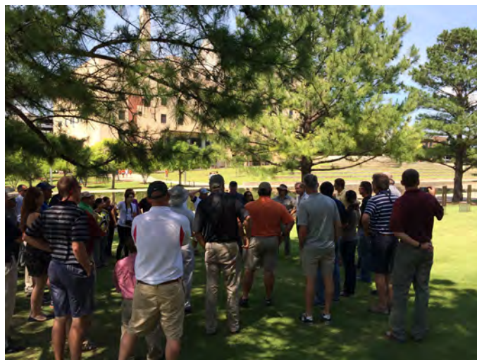
Attendees at the Oklahoma City National Memorial and Museum.