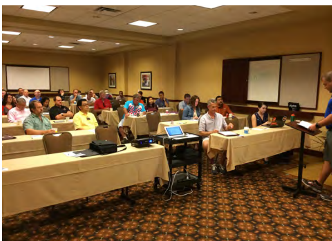
Attendees at the 2015 SERA-IEG 25 meeting in Oklahoma City.