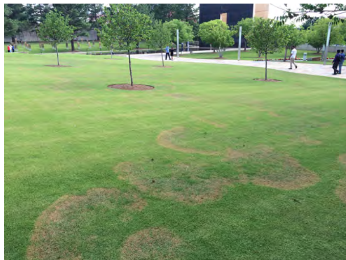
Large patch at the Oklahoma City National Memorial.

In addition to various state turfgrass activity reports, updates on turfgrass pathology, nematology, sports turf safety, warm-season grass breeding and urban extension programs were presented the first day of the meeting. Later that day the group toured the Oklahoma City National Memorial and Museum on Tuesday afternoon to see the various challenges the National Park Service deals with regarding zoysiagrass and trees at the site. The challenges include large patch disease, foot traffic, ice formation on trees, and growth of tree roots through the site. The SERA-IEG 25 meeting was coincidentally held on the 20 th anniversary of the bombing of the Federal Murrah Building.